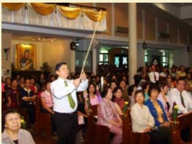
A fishing rod with a fish - a proactive symbol for uplifting human dignity. We are called not only to give the fish but to teach those whom we help how to fish.