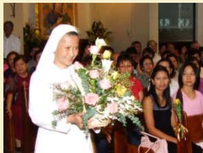
A basket of flowers - a thanksgiving symbol of God's Love for CWS staff, beneficiaries, benefactors and volunteers.