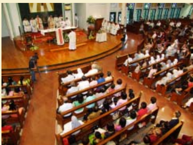
About 600 people turned up for the Mass at OLPS.

Looking forward, challenges abound for CWS, including competing for a piece of the charity fund-raising pie, catering to the needs of an increasingly ageing population in Singapore and service development for other needy groups. However, CWS will remain faithful to its missions, and continues to serve the needy with compassion, vigour and dedication.