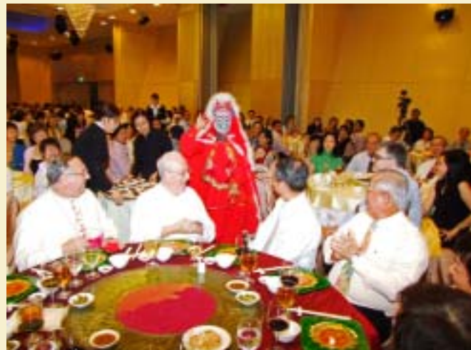
The audience was captivated by the 'face changing' performance.