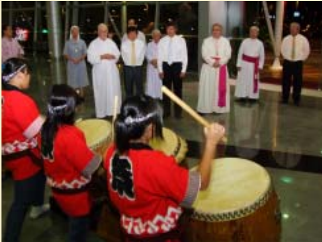
YouthReach drum group received our guests-of-honour with a lively taiko performance.