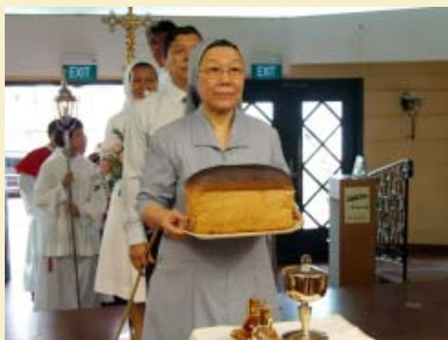
A loaf of bread - a historical symbol of CWS outreach to the poor and needy, the Breadline in 1959.